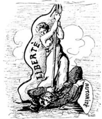
Liberty Killing Authority

Napoleon talked about freedom in the following way: "Stupid people, cowardly people, since the continuation of oppression does not give you the necessary energy, since you content yourselves with useless complaints when you could be roaring, since you are millions and you let a dozen children armed with little sticks control you as they wish, obey! Walk and do not worry about your wails and, at least, try to be unhappy if you cannot be free." During the French Revolution, millions of people died in the name of freedom. They vainly believed that the master was the enemy and that, if they killed him, they would become their own masters. What an illusion! Nowadays, the French must follow more laws than ever before. The country does not even exist anymore; it has become an integral part of the European Union. Amazingly, France is still considered as a free and democratic country. Isn't it strange!