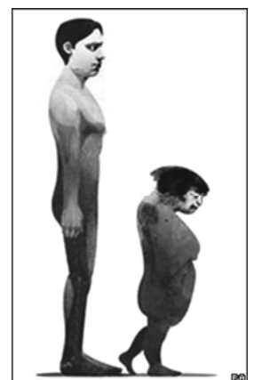
Two Distinct Species

I must become aware that the highest frequency lies hidden inside each human being. It is called a “soul” (the Supreme Being within each individual). Human souls differ from those of other species. They are able to grow from life to life until they can unite with willing, fully conscious human bodies. Once I understand my soul’s potential, I can surrender my free will to it and let it guide me efficiently towards its long-standing plan: the union of body and soul. ⇒