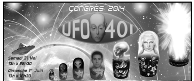
Ad for the 2014 Montreal UFO Congress (Notice the gradual evolution suggested.)

This recipe allowed humanity to go from the age of religions to atheism, then ET-ism. Even the Vatican agrees: “It is entirely credible that in the enormous distance between angels and humans, there could be found some middle stage – that is, beings with a body like ours but more elevated spiritually.” More obvious is Pope Francis’ most recent declaration (April 2014): “Dear brothers, I wanted to tell all of you that we are not alone in the universe. Science has already made so much progress that, most likely, we will soon know our new brothers and sisters, with whom we will exchange a sign of peace. On that day, there will be wonder and we will remember that God is one and watches over us all.”